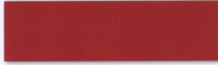
*Bright Red (see note on reverse side)